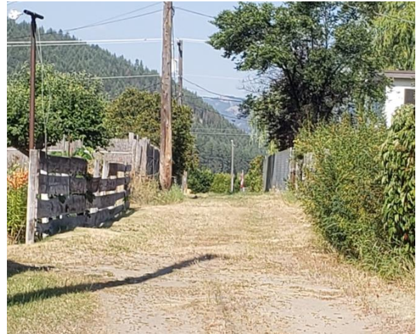
Clear unobstructed alley

No personal property / storage of any kind is permitted on Village property. "Village of Midway Fire Services and Regulations Bylaw No. 451, 2014" (47).