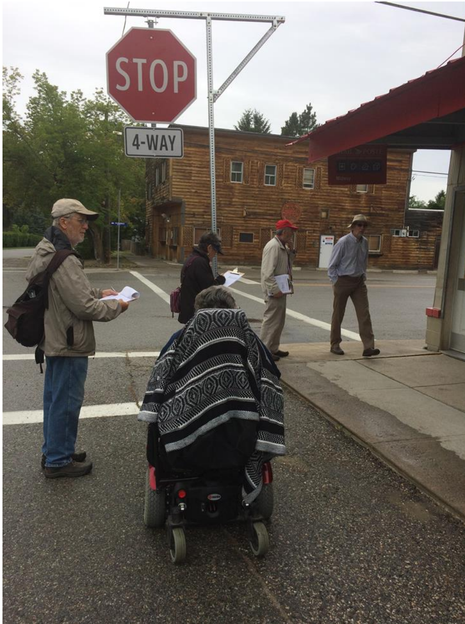
Figure 1 The audit participants discuss the situation at Florence & Fifth

demarcation or don't exist at all. Benches aren't accessible or located where they could be useful. There are no public drinking fountains in any park.