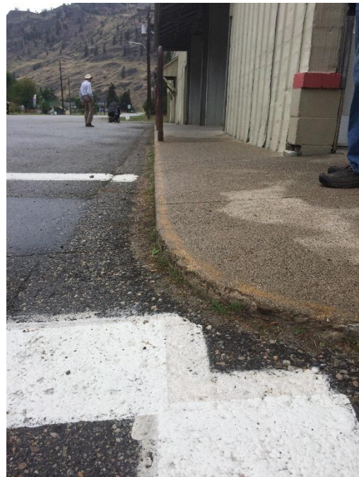
Figure 2 The offending curb at the northeast corner of Florence & Fifth