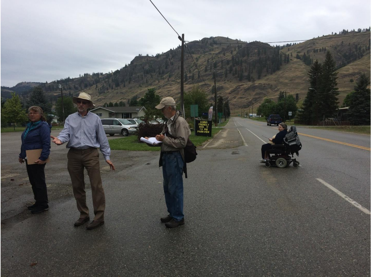
Figure 3 Participants on Florence Street near the library