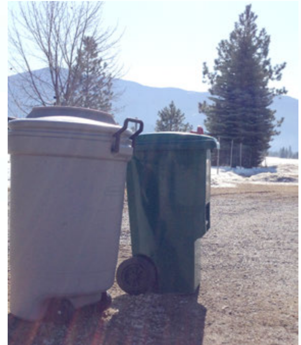
In 2016, RDKB's Green Bin program diverted 490 tonnes of compostables from the landfill.